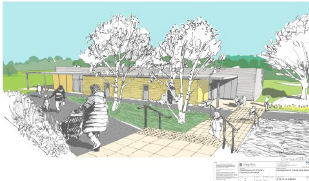
Perspective of new classroom block